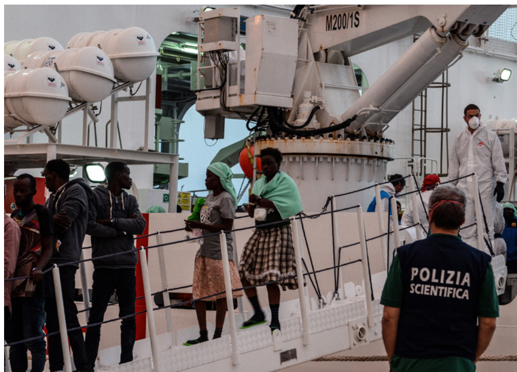
PHOTOGRAPH: ARRIVAL AT THE PORT OF POZZALLO (SICILY, 2015)

Source : the data relating to these journeys was gathered by Elsa Tyszler in Morocco and Melilla between February 2015 and July 2017; www.openstreetmap.org/ ; the symbol for sexual violence was created by Datacrافت from Noun Project.